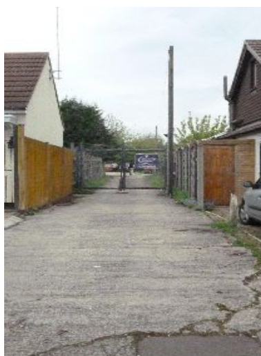
Entrance to Site